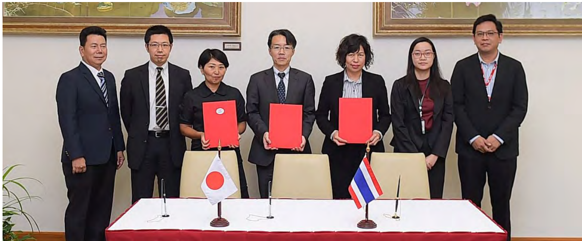
The signing ceremony

To start Proof of Concept of information transmission that based on Thailand Postal Network